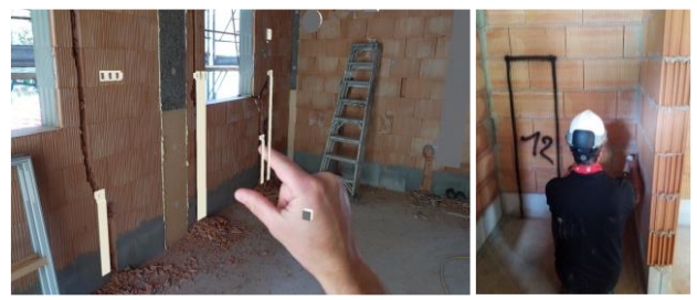
Figure 1. Marking works with the AR HMD (Trimble XR10 - Microsoft HoloLens II)

The carried out marking works were recorded via video and afterwards the times of the works were analysed and compared.